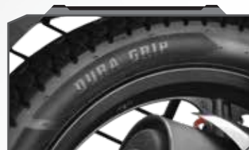
DURA GRIP TYRES