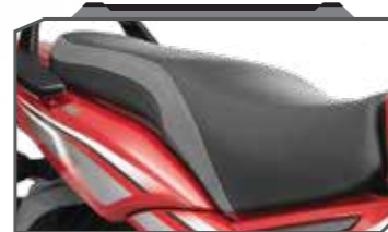
PREMIUM DUAL-TONE SEAT