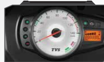
MULTI-FUNCTIONAL DIGITAL CONSOLE