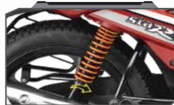
5-STEP ADJUSTABLE SHOCK ABSORBERS